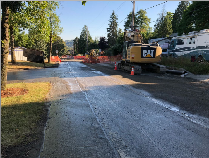
53 RD AVE TUKWILA, WA