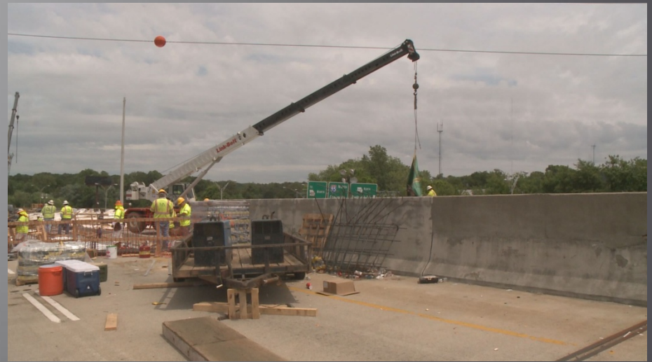
Max J Kuney

New freeway crossing at NE10th street in Bellevue. Improved access to the north end of downtown Bellevue.