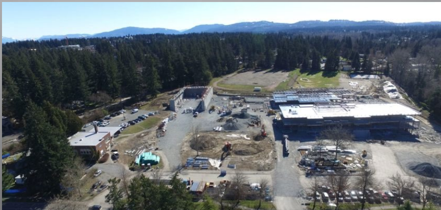
HIGHLAND MIDDLE SCHOOL