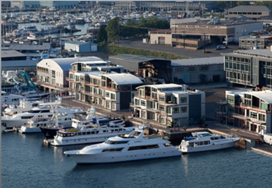
SALMON BAY MARINE CENTER

Charter Construction Class A buildings of 10,000 SF offering premium marine office and shop space