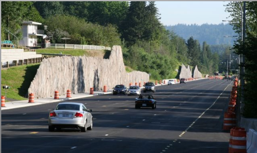
SR 900 ISSAQUAH