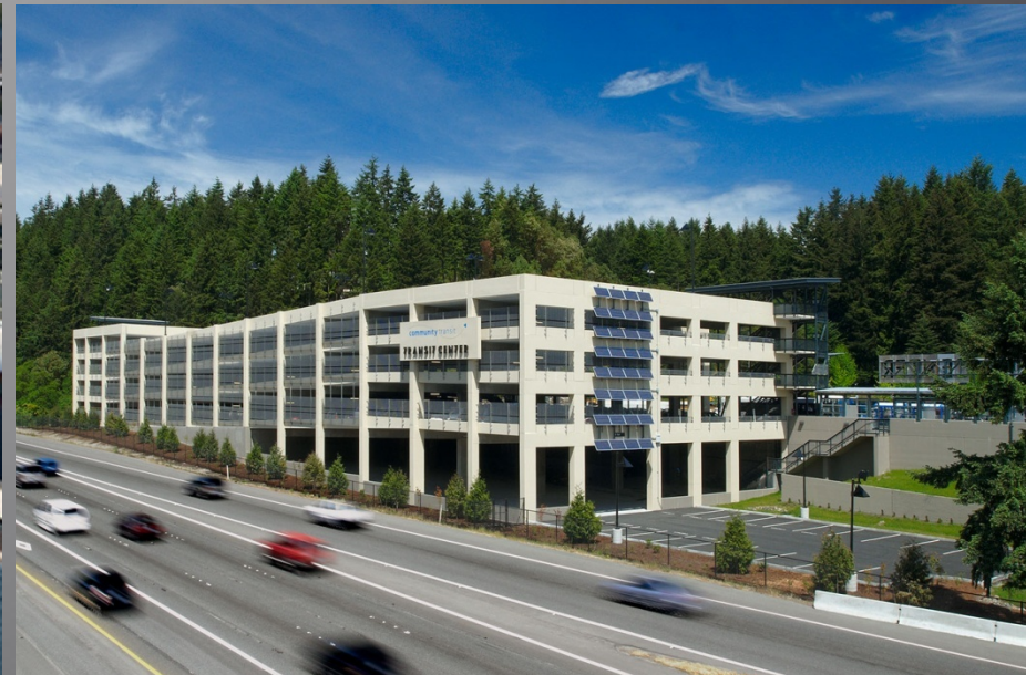
MOUNTLAKE TERRACE PARK AND RIDE

Bershauer Construction A four story, five level parking garage 890 total parking spaces