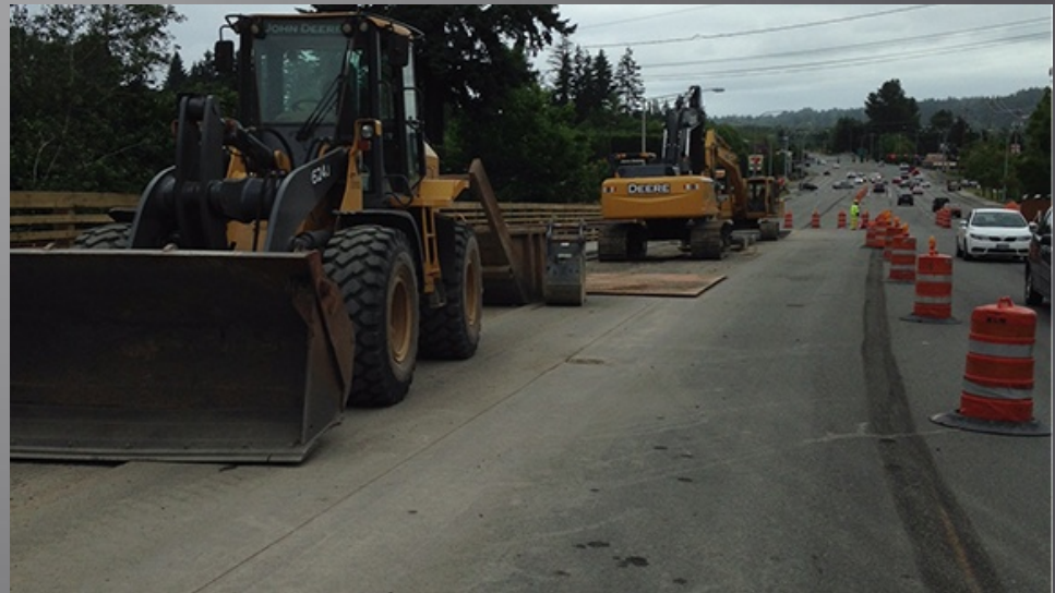
MARINE VIEW DRIVE

Complete rebuild of 53 rd ave. including new roadway, sidewalks, curb and gutter and utilities.